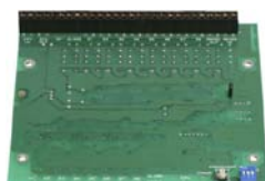
Part No. K461