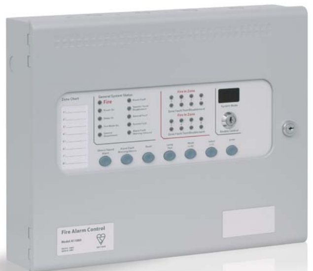
Model No. K11080M2

Note: Also available is the Sigma Sounder Board (K461) which is compatible with all Sigma CP and CP-R panels which have operating software version V3.0 or above. See DS48 (page 54) for more details.